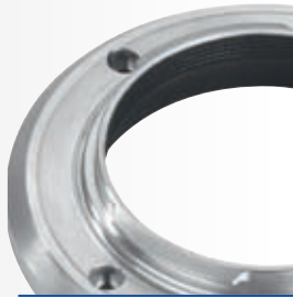
Micro 4/3 mount