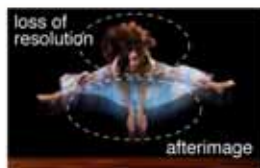
3D Noise Reduction Alone Afterimage and some loss of resolution is seen