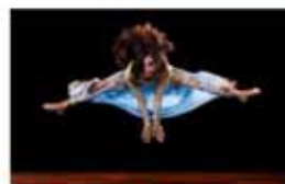
New Hybrid Digital Noise Reduction Clearer images in difficult conditions