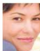
Flesh Tone Mode:OFF Flesh Tone Mode:ON