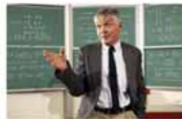
DRS ON: Both highlights and shadows are clearly visible