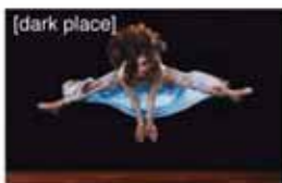
Without Noise Reduction Some noise is evident when gain control is turned up

The innovative New Hybrid (2D/3D) Digital Noise Reduction function also suppresses afterimages, even in difficult lighting conditions.