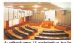
Auditoriums / Legislative halls