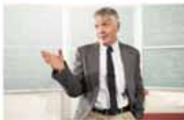
DRS OFF: With the iris expanded, this blown highlight appears on the blackboard

The gamma curve and knee slope are optimized to match the contrast of each pixel in real time. This increases the dynamic range without affecting the normal pixels.