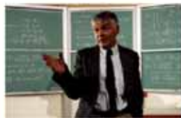
DRS OFF: With the iris contracted, a blocked shadow appears on the figure